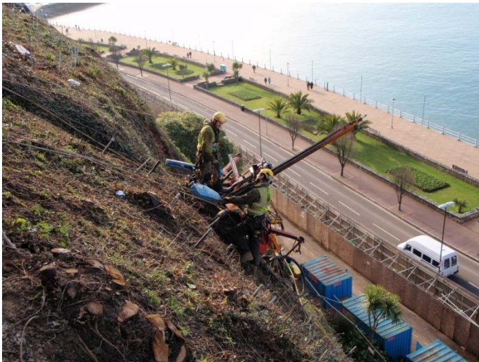
Marini rig installing hollow self drilling soil nails with 75mm sacrificial bit.