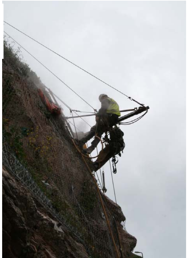
Specialist lightweight DTH rig drilling 80mm diameter holes for anchors.