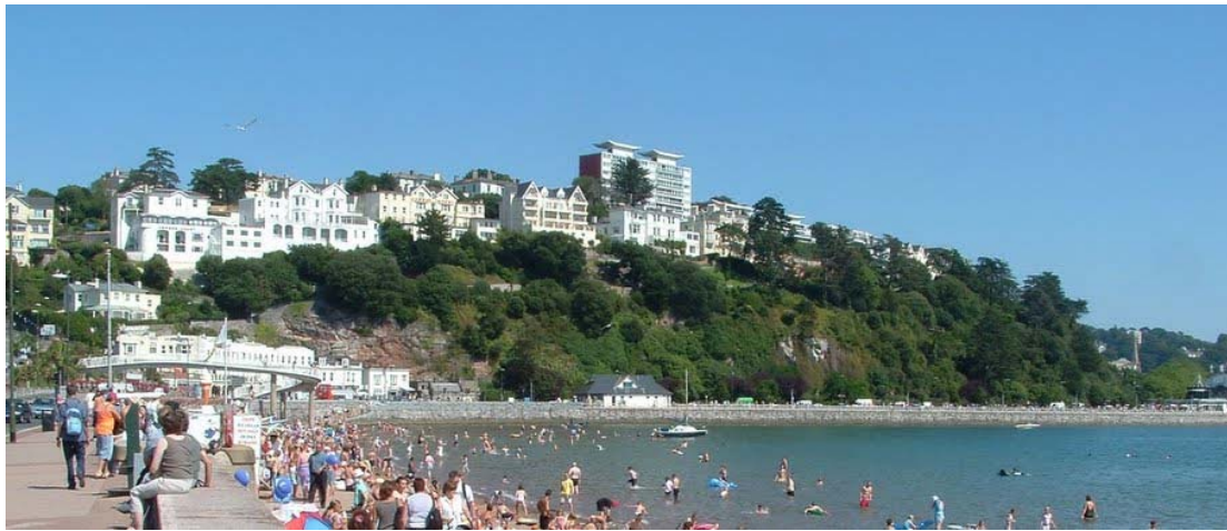
Rock Walk gardens before tree removal

Rock Walk Gardens was a once neglected Victorian garden cliff walk among the steep slopes and limestone rock faces backing the Marine Parade at Torquay. Following extensive tree removal in 2008 prior to regeneration of Rock Walk, it became obvious that the slope and rock faces would need significant stabilisation works.