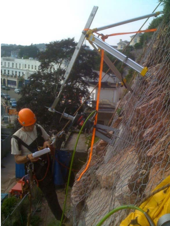
Testing rock anchors to BS 8081