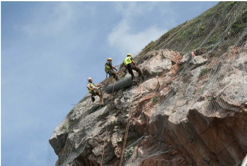
Hanging rock netting over steep rock buttresses.