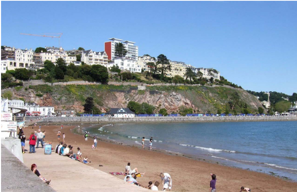
The finished job, on time and well within budget