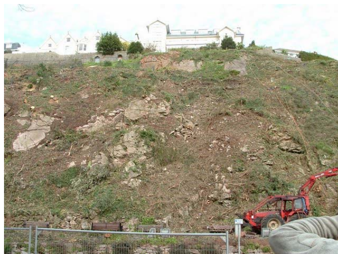
Typical unstable areas of slope exposed by tree removal