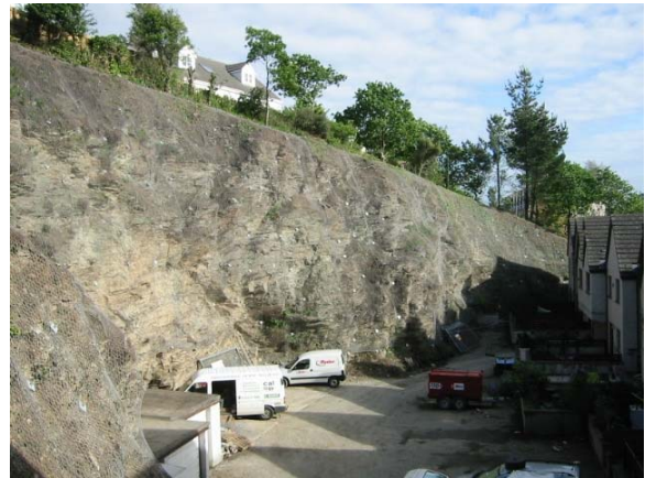
Rock netting tightly contoured with tensioned cable cross strapping