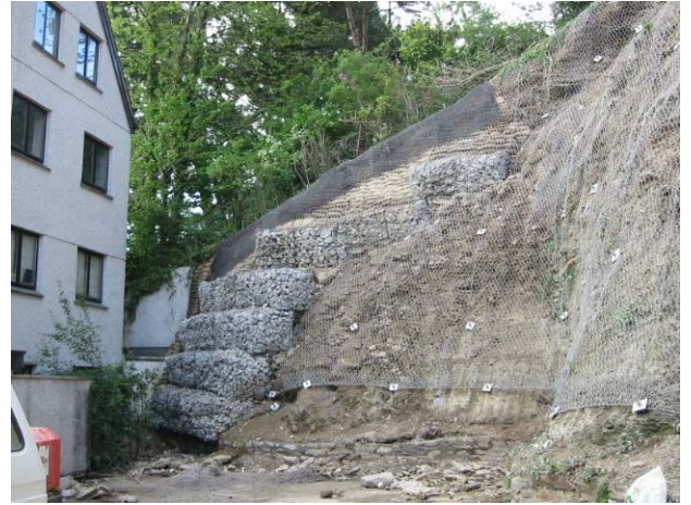
Gabion buttress and dentition