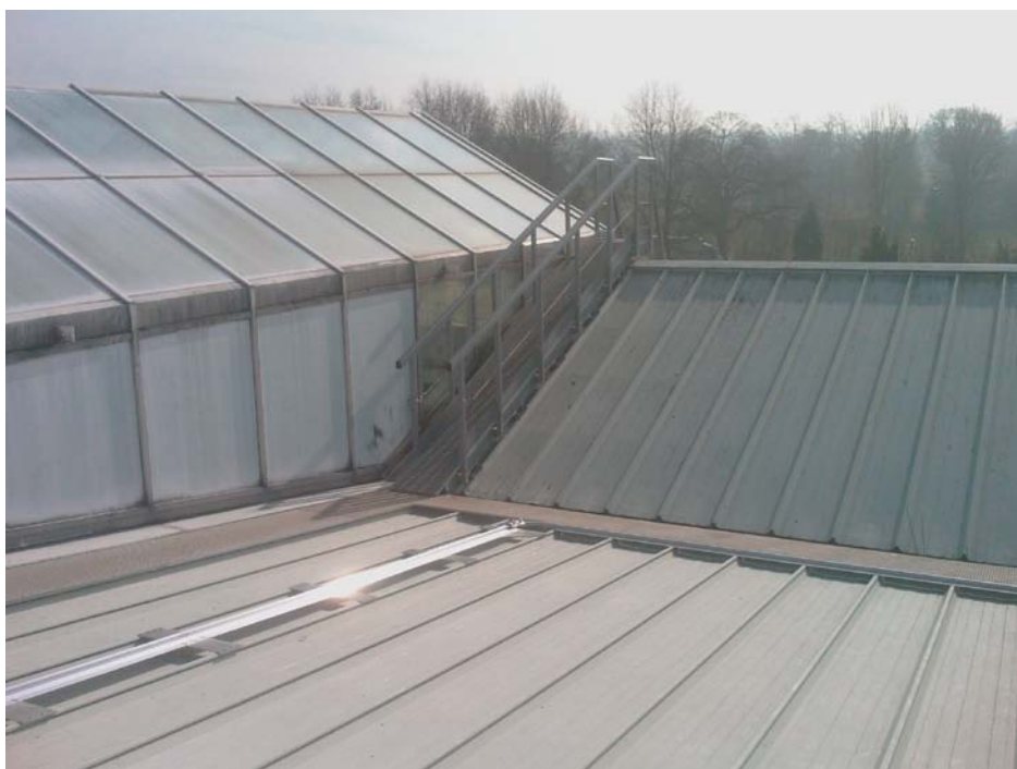
Fibreglass anti-slip textured walkways provided a safe surface to walk on and protected the roof sheets from footfall damage.