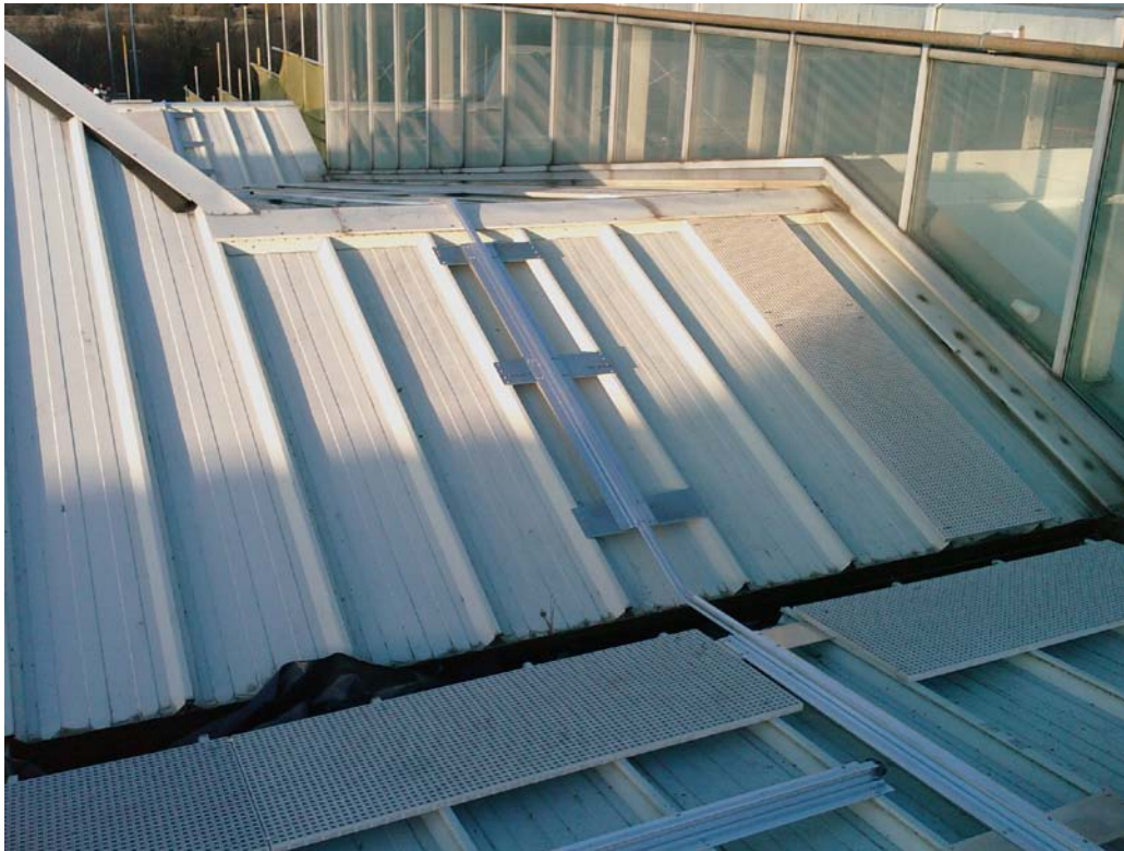
Roofsafe rail fitted to the built up metal roof sheets and contoured to follow the roof profile.

To provide access and to protect for individuals against the implications of a fall when working around the roof areas on the leisure centre.