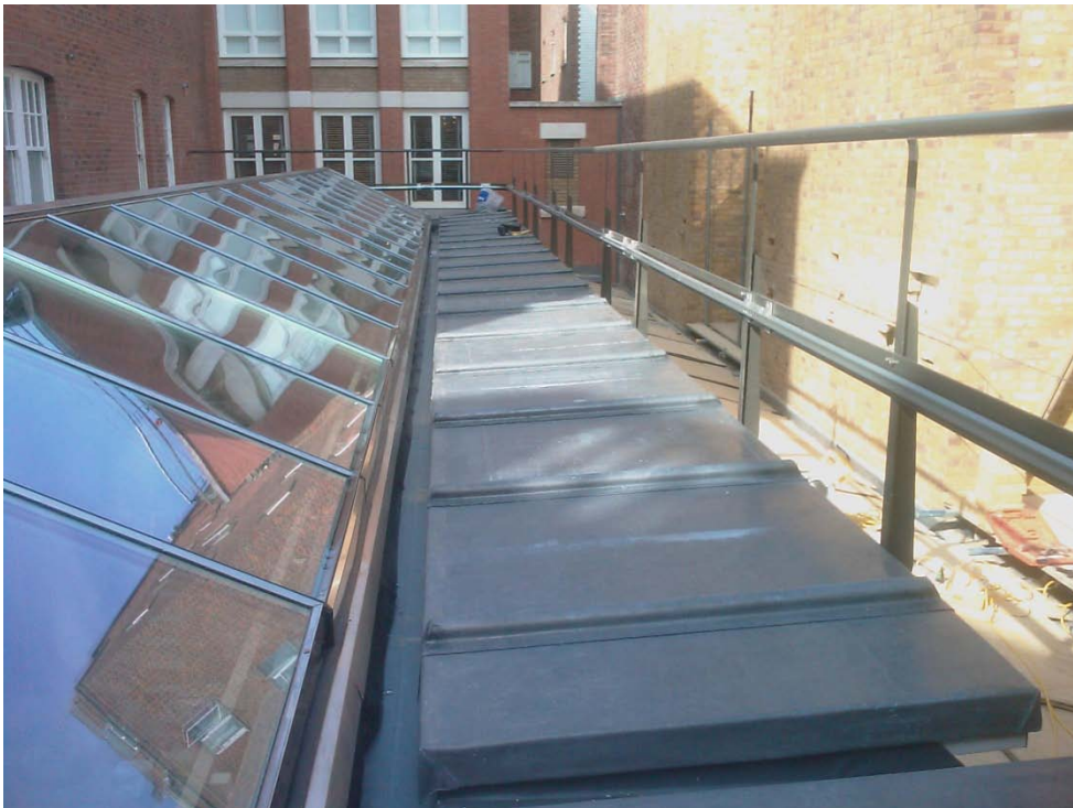
Unirail lifeline fitted to the balustrade.

Securing a safe means of access and protecting individuals against the implications of a fall when working around a new conservatory roof.